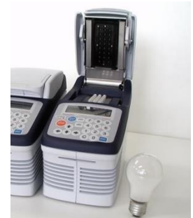
All you need is a temperature control device.

Only 9 minutes ! Without purification ! Without separation ! Only temp. control !