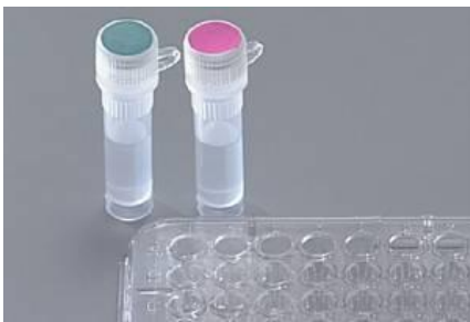
The original reagents which enables DNA extraction by using heat treatment only.

The reagents kit that developed for DNA extraction from whole blood samples make you easily prepare DNA samples which can be directly use for PCR. The method is very simple, no complicated purification / separation process is required. As a result, DNA samples that can be added directly to PCR can be prepared in as little as 9 minutes.